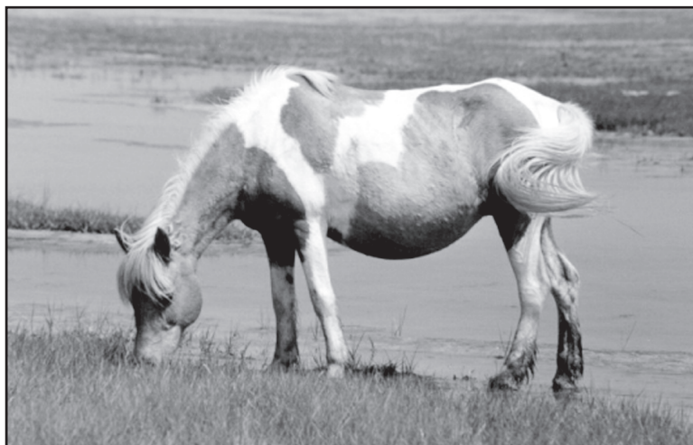
Text and photographs from "The Wild Horses of Assateague Island," National Park Service, US Department of the Interior